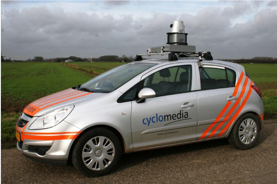
CycloMedia production vehicle with the unique DCR 7 camera system